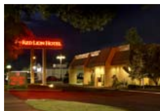
Red Lion Motel

Deborah Robinson sales@qualityinnmedford.com 800-547-4747 1950 Biddle Road Medford, OR 97504 www.qualityinn.com