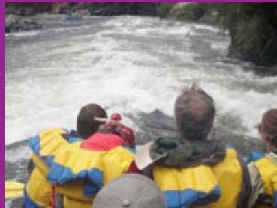
Rafting the Rogue River