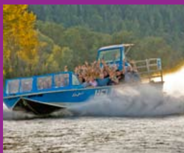
Hellgate Jetboat Excursions