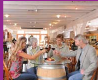
Rogue & Applegate Valley wine tasting