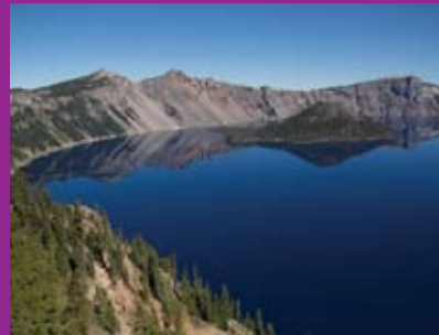
Crater Lake National Park