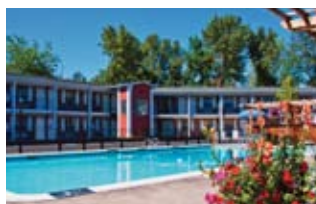
Best Western Horizon Inn

The Ginger Rogers Craterian Theater is the Rogue Valley's premiere live performance venue. Programs include a wide variety of Broadway musicals and stage plays. It's located in the heart of downtown Medford.