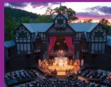
Oregon Shakespeare Festival