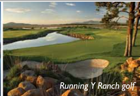
Running Y Ranch golf