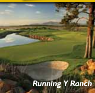
Running Y Ranch

The best of Oregon golf. Four distinct regions. Southern Oregon and beyond.