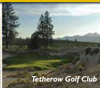
Tetherow Golf Club