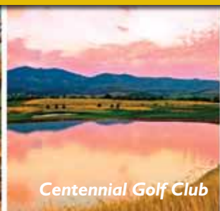
Centennial Golf Club