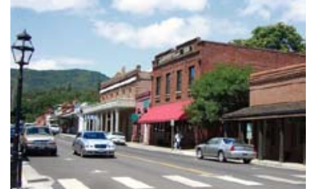
Jacksonville, National Historic town

Jacksonville, a National Historic gold mining town, is nestled in the rolling hillsides of Southern Oregon and is the Gateway of the Applegate Valley Wine Trail. Long time home of the Britt Music Festival, it offers plenty of outdoor activities too. The Jacksonville Woodlands comprises over 16 miles of beautiful hiking trails on 350 acres. Our new Jacksonville Forest Park offers mountain biking and equestrian/horseback riding trails along with running/hiking. Fishing, swimming, rafting and Jet boating are nearby. Come visit us!