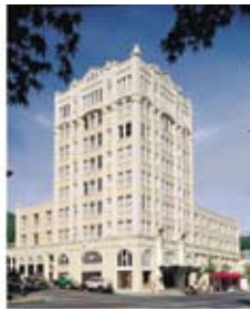
Ashland Springs Hotel

In the center of Ashland, OR sits historic landmark ASHLAND SPRINGS HOTEL, the premier choice for lodging in Southern Oregon. Lovingly restored in the year 2000, this fully appointed hotel is a haven of taste and elegance reminiscent of small European hotels, harkening back to the days when travel was adventurous and the destination was part of the fun. It offers 70 comfortably appointed guests room, award-winning dining at Larks Restaurant, relaxing treatments at Waterstone Spa & Salon, and most importantly, walking distance to all Ashland's attractions. Within a 20-minute drive visit historic Jacksonville, numerous wineries of the Rogue River and the Applegate Valleys, or find yourself white water rafting down the Klamath River.