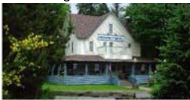
Historic Prospect Hotel

Crater Lake National Park's closest full service town is showcased by the Nationally Registered Prospect Historic Hotel-Motel and Dinner House. The Historic Hotel is a 10 room Bed and Breakfast Inn with private baths and beautiful quilts on every bed. Hearty, full, breakfasts greet you in the morning. 14 unit modern motel on the same property. Take a short stroll to the Rogue River and three water falls. Situated for Hiking, Biking, Rafting, Fishing, Boating, Birding, Hunting, Cross Country Skiing or Snowshoeing. The Hotel Restaurant is "the best Dinner House between Medford and Crater Lake" according to Sunset Magazine. The "Best Prime Rib in Southern Oregon" or "Salmon better than we caught" paired with local wines and beers.