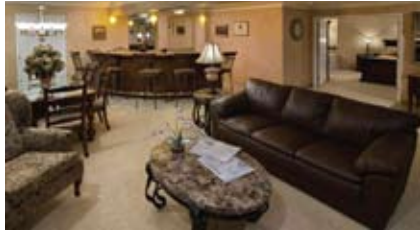
Rogue Regency Inn & Suites

Welcome to Rogue Regency Inn & Suites in Medford, southern Oregon's finest full-service hotel. Located just off Interstate 5 (exit 30) on Biddle Road, it is the perfect place to enjoy all that this exciting region has to offer. Rogue Regency Inn & Suites has earned a reputation for fine service and hospitality, and offers something for everyone, whether you are seeking Medford, Oregon lodging for business or pleasure. We have 203 stately rooms that will impress even the most discriminating traveler – including the top floor Presidential suite. Our impressive list of amenities includes a heated indoor pool and spa, a fitness center, $4.99 hot, made-to-order breakfast menu for our hotel guests in The Regency Grill, Chadwicks Pub and Sports Bar, A Swedish Tradition on-site massage therapist, and Xpressions hair and nail salon. Host Hotel for Medford Cruise 2012