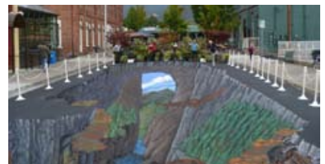
Street painting of the Hellgate Canyon

This event is provided to our community at no charge. Thousands of visitors gather for a weekend of fun, music, and art in Downtown Grants Pass. Art