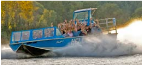
Hellgate Jetboat Excursions roar down the Rogue

An unforgettable adventure... Enjoy a jetboat trip on the legendary "Wild and Scenic" Rogue River that both young and old will enjoy. Experience the wildlife and history of the river on a fully-narrated tour to Hellgate Canyon. Five exciting trips to choose