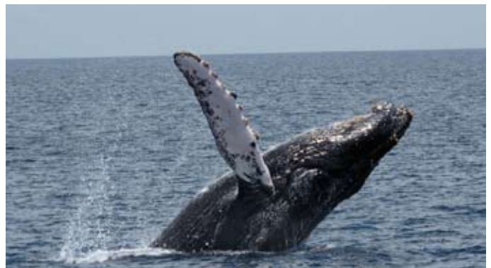
Humpback whale off the Southern Oregon Coast

Whale Watching December , month-long. Watch gray whales migrate south from their feeding grounds in Alaska to their calving lagoons in Baja Mexico. www.whalespoken.org .