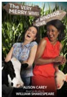
Oregon Shakespeare Festival

Join the Tony Award-winning OSF's fabulous 2012 season in style with a variety of special package options from our Package Partners. The season begins February 17th and runs through November 4th. 11 plays on three unique stages in charming, cosmopolitan downtown Ashland, Oregon.