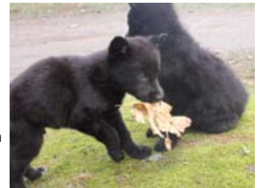
Wolf pups at Wildlife Images

For tour and reservation information please call 541-476-0222 or visit our website at www.WildlifeImages.org