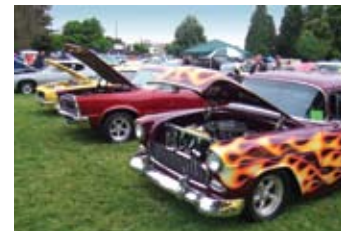
Medford Cruise Show and Shine