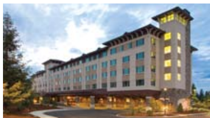
New hotel at Seven Feathers

Spa Package at $129 + tax any day of the week (incl. standard