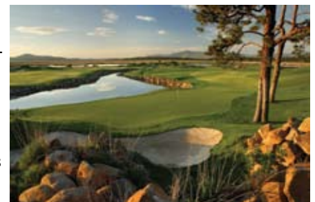
Sunset on Running Y golf course

Secluded in an unspoiled corner of Southern Oregon, Running Y Ranch is a restful sanctuary that only Mother Nature could have created. With a limitless array of activities and amenities, you're never too far from recreation, adventure and play.