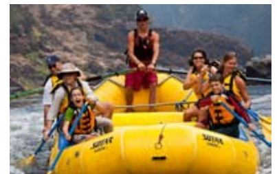
Rogue Wilderness Adventures

Southern Oregon is home to the famous Rogue River. Visitors to this region have been exploring this fabled river for over a century and now it is your turn. Come spend the day exploring this wonderful river area and see it up close as you float by with a guide in our comfortable raft. All trips are guided and offer transportation and an amazing riverside picnic. Trips operate between April and October. www.wilddrogue.com 800-336-1647