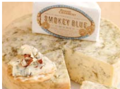
Rogue Creamery Smokey Blue Cheese