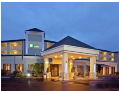
Holiday Inn Express