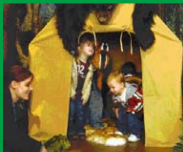
Douglass County Museum