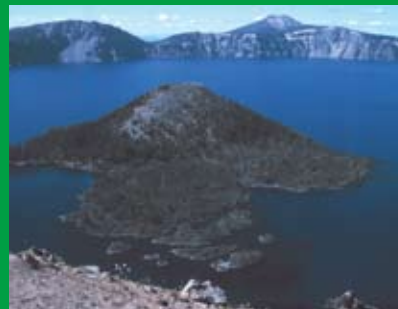
Crater Lake National Park