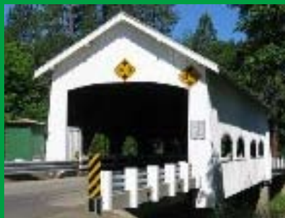
Rochester Cover Bridge