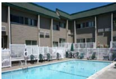
Windmill Inn of Roseburg