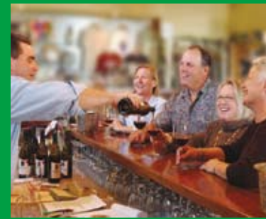
Umpqua Valley Wine Tasting