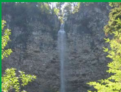
Highway of Waterfalls

For a complete list of hotels please visit www.visitroseburg.com