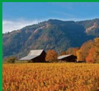
Umpqua Valley Wineries