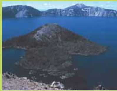
Crater Lake National Park