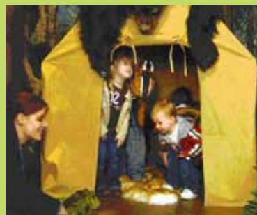
Douglass County Museum