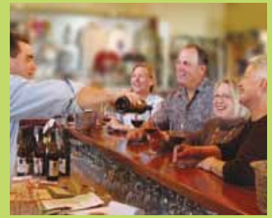
Umpqua Valley Wine Tasting