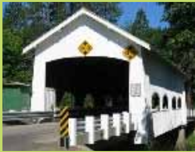
Rochester Cover Bridge