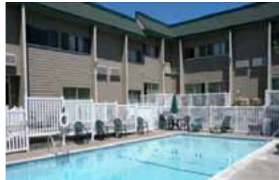
Windmill Inn of Roseburg