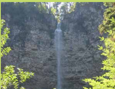
Highway of Waterfalls

For a complete list of hotels please visit www.visitroseburg.com