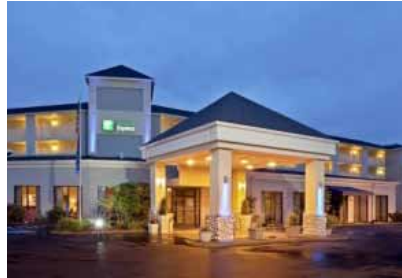
Holiday Inn Express