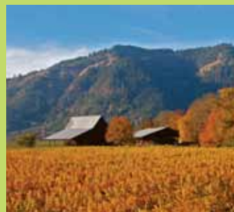
Umpqua Valley Wineries