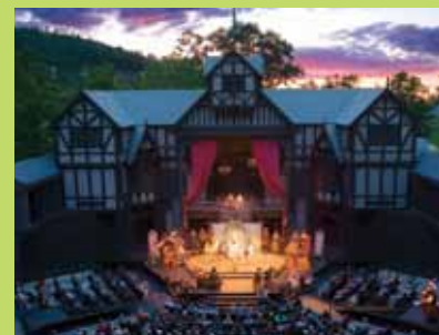
Oregon Shakespeare Festival