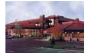
Rogue Regency Inn & Suites