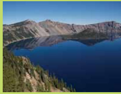
Crater Lake National Park