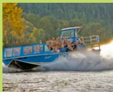
Hellgate Jetboat Excursions