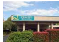
Quality Inn & Suites