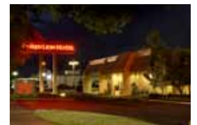
Red Lion Hotel