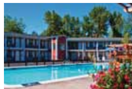
Best Western Horizon Inn

For a complete list of hotels www.travelmedford.org