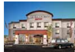
SpringHill Suites by Marriott