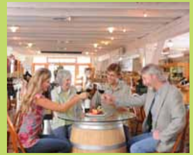
Rogue & Applegate Valley wine