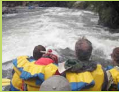
Rafting the Rogue River